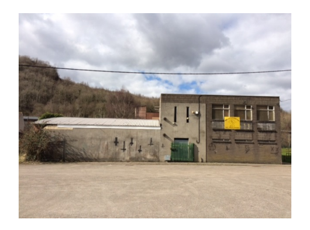
Appendix B Longbridge Baths External Images